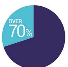
Over 70% of our executive search appointments are promoted within the first year.

For further information please contact on +91 98413 16211 or info@velsinfotech.in